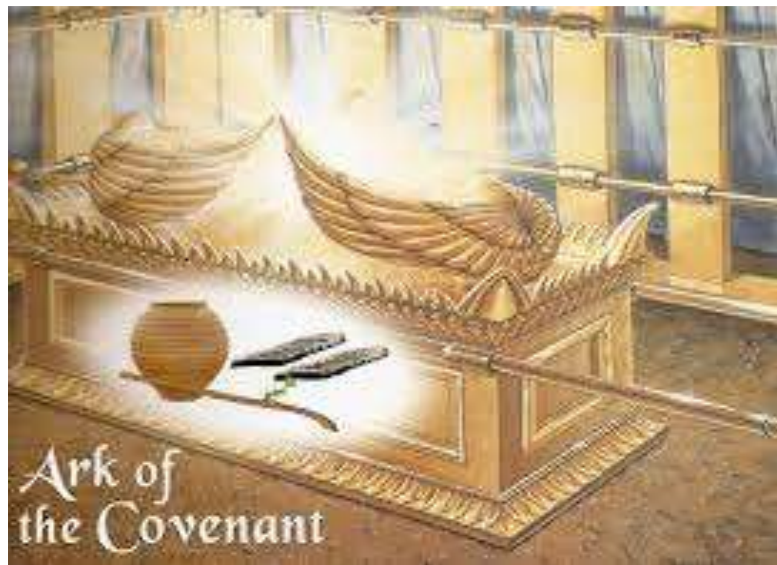
Ark of the Covenant